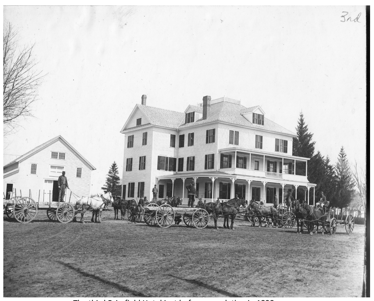
The third Brimfield Hotel just before completion in 1898