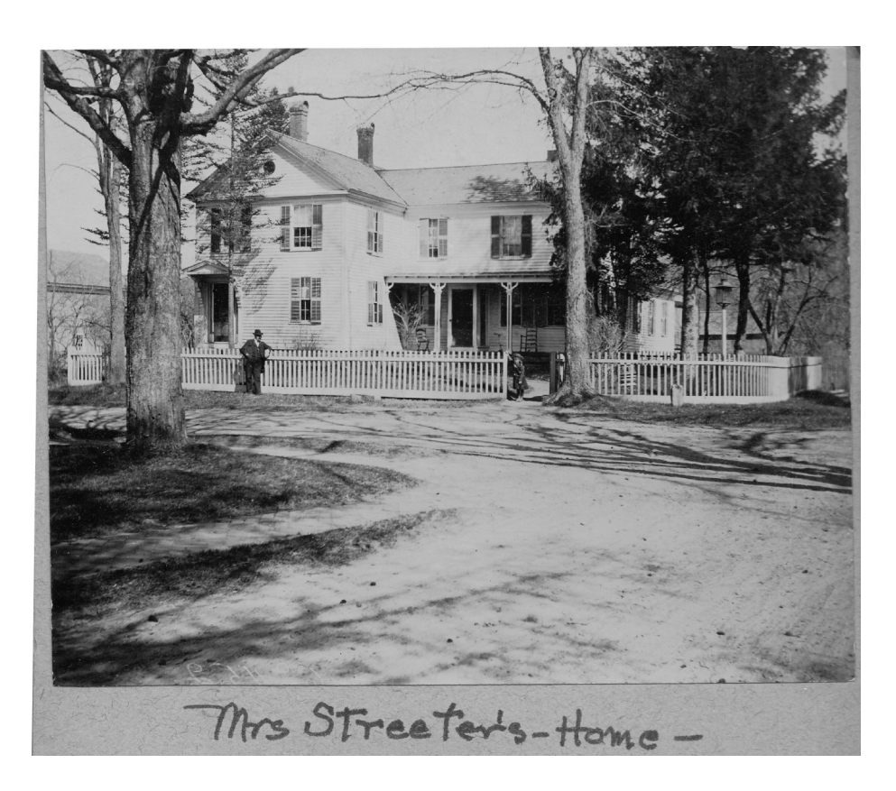
Marsh-Streeter House – 149 Brookfield Road